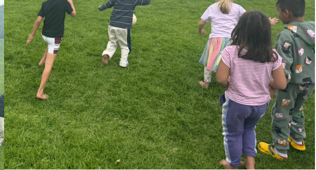
Room 2 playing mini football games