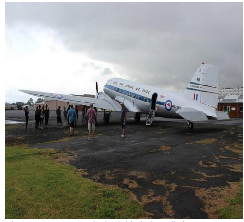
The WW2 era DC3 which Child Flight will charter

May 24, 2015 from 12 to 4:30pm Hamilton Airport, International Lounge