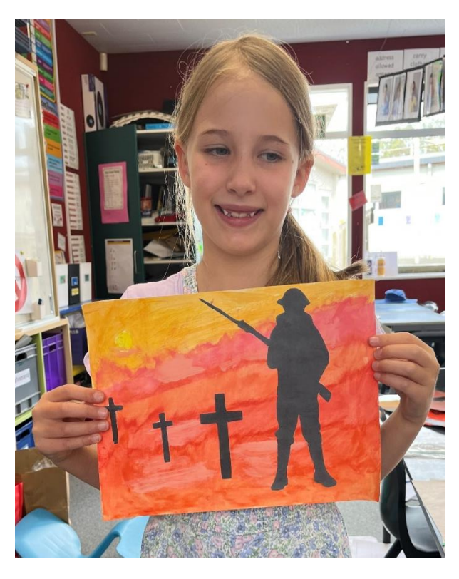
Produced by Scarlett Swain