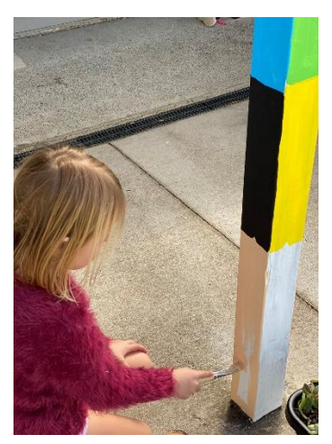
Room 2 children are proud of making a change and helping to make our school beautiful.