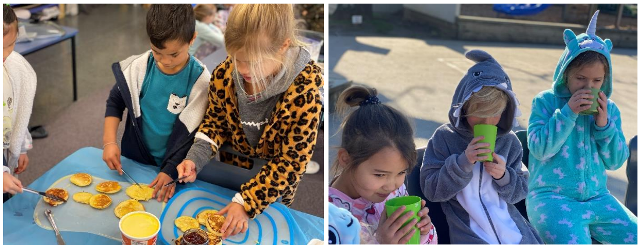
We worked together to make pikelets and hot chocolate for a delicious shared kai.

I was making sweet pikelets and we were making milo. Sweet, yummy milo. We were in our pyjamas. By Hannah-Leah Warbrick.