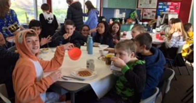
Wishing you all a happy and safe holiday from all of us in Room 8.