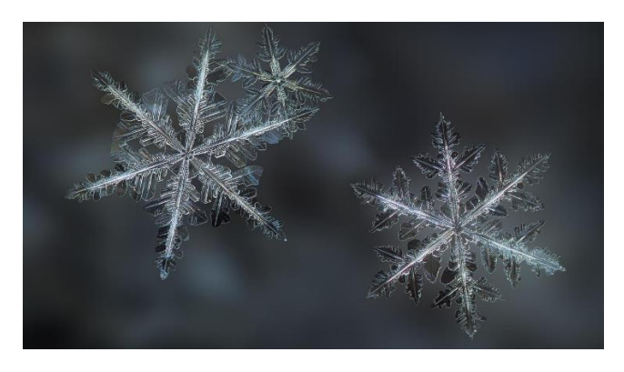
The subzero wind Freezes the whole entire Land and countryside