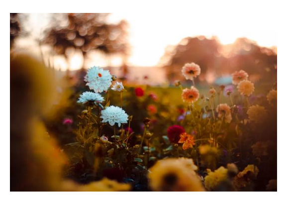
Spring Flowers start to bloom. Birds whistle up in the sky. The sun starts to shine. By Ella. B