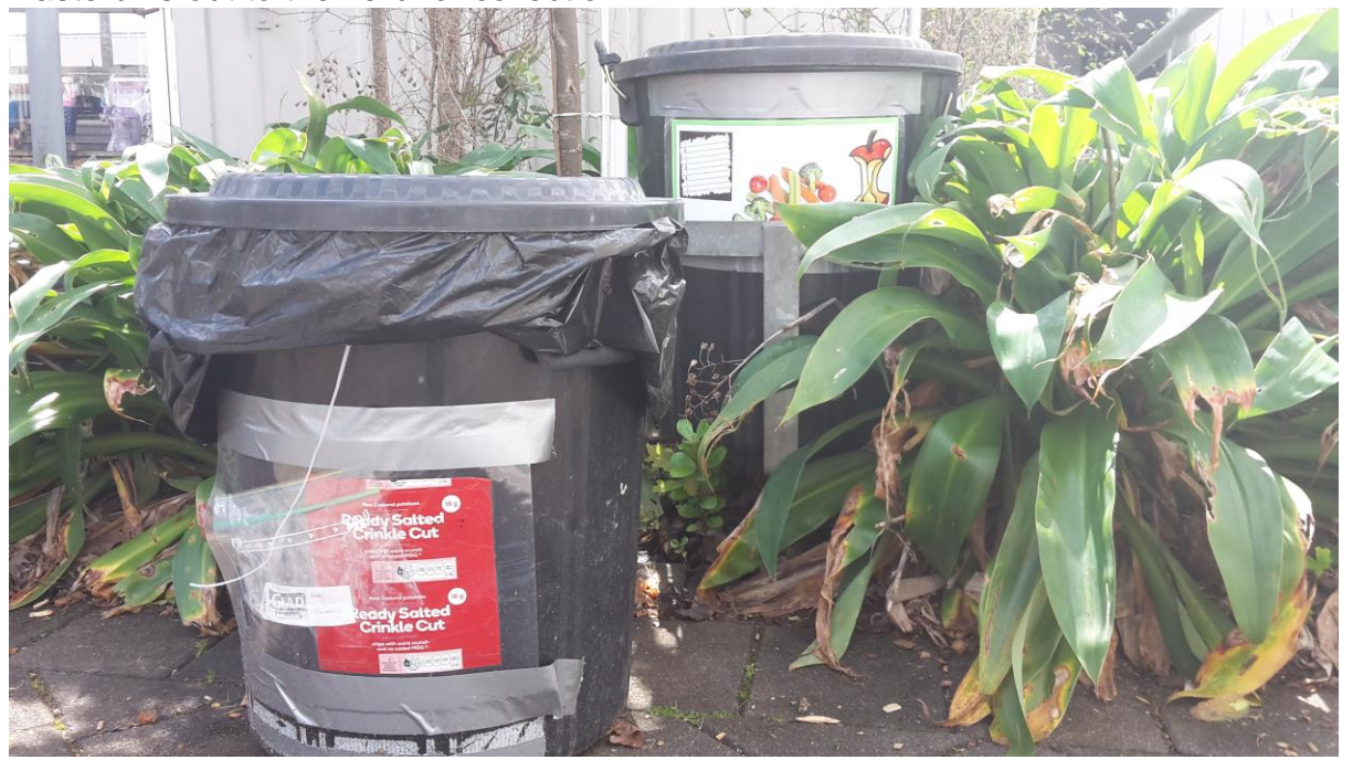
A special thank you must go to our parents for doing your part with the litter-less lunch boxes. You have made this transition possible.

Thank-you to a fabulous effort from Room 8 and the school community for taking on board our initiative to reduce waste in the school. Our school grounds are already significantly tidier. We are progressing well with the disposal of rubbish into either the worm bins, or the soft plastics bins. It is hoped that by next term we will have removed almost all historic waste from the school and we will only need to put 2 of our 4 general waste bins out to the kerb for collection.