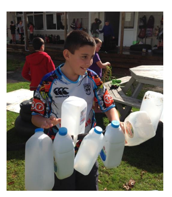
Raft Building Day Rooms 6 & 7