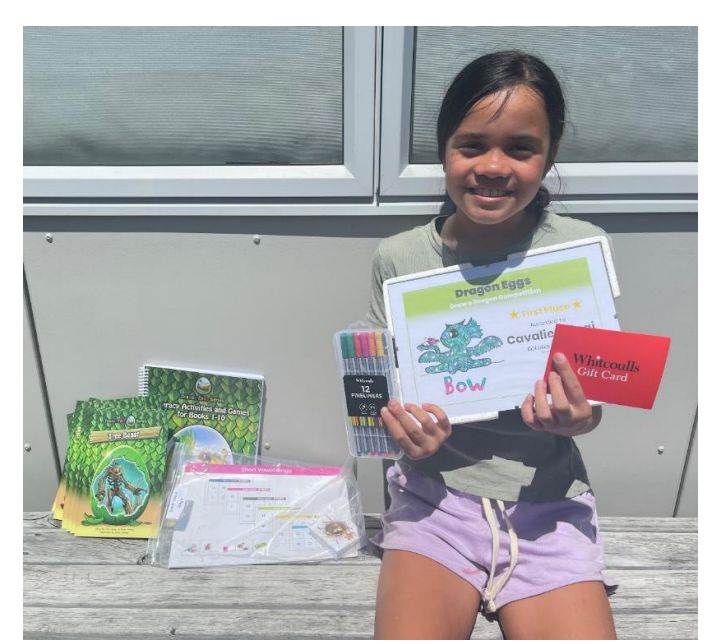
Congratulations to Cavalier who won these prizes for drawing a dragon.